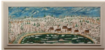
Massey's Cove, 1626