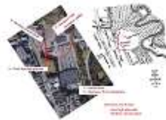
Figure 2 Gardner burial plot

A contributing factor for Thomas' remains missing was that Gardner's Hill was leveled to make way for a new road. Sidney thought