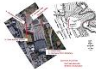
Figure 2 Gardner burial plot